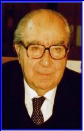
Carlo Morelli Italy (1917 – 2007)