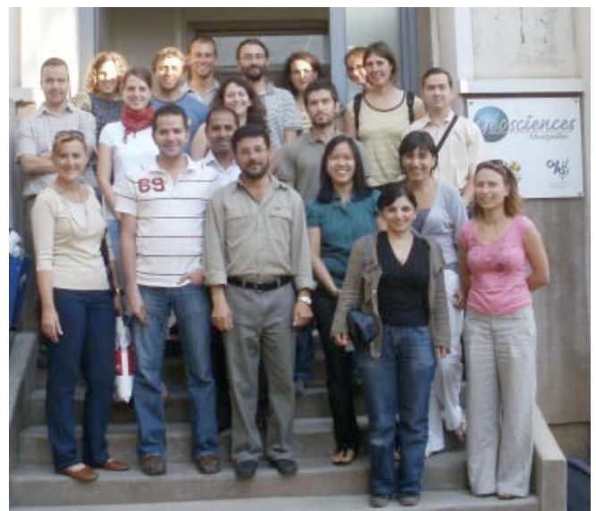
The YSTC2010 participants