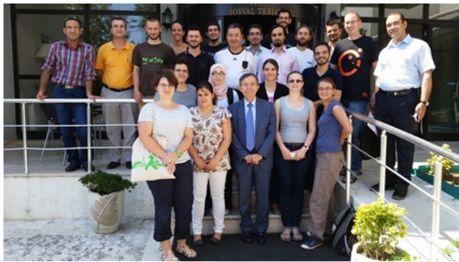
YSTC course, Istanbul Technical University, Maçka

The next 35th General Assembly of the European Seismological Commission will be held in Trieste, Italy, on September 2016; organized by the Italian National Institute of Oceanography and Experimental Geophysics (OGS).