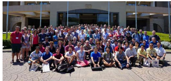
Participants of the SEDI symposium

The next 35th General Assembly of the European Seismological Commission will be held in Trieste, Italy, on September 2016; organized by the Italian National Institute of Oceanography and Experimental Geophysics (OGS).