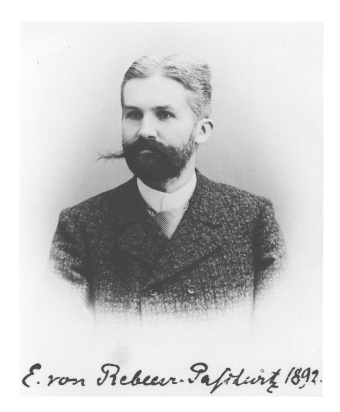
Figure 1. Ernst von Rebeur-Paschwitz (1861–1895).

Georg C. K. Gerland (1833–1919) presented von Rebeur-Paschwitz's proposal at the Sixth International Geographical Congress, London, in 1895 and promoted it further after von Rebeur-Paschwitz's early death. The ideas were embraced by many colleagues and in 1901 Gerland welcomed colleagues from Austria–Hungary, Belgium, Denmark, Ger-