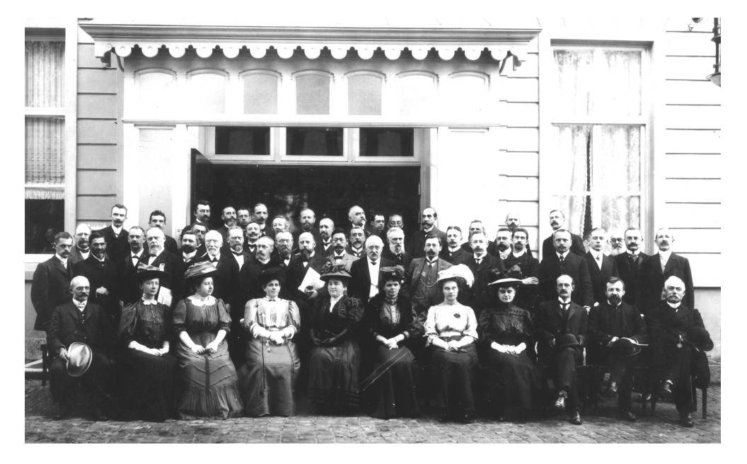
Figure 3. Participants of the First General Assembly of the International Seismological Association in The Hague, the Netherlands, 21–25 September 1907.

ferent seismic phases from different authors and founded, during the Fifth IUGG General Assembly in Lisbon (1933), a commission for the publication of new seismic travel-time tables. Mostly derived from the data collection at the ISS, the result of this international effort was the Jeffreys–Bullen tables published in its final version in 1940 (Jeffreys and Bullen, 1940). These seismic travel-time tables became the primary basis for seismic event locations worldwide and were used at the ISS/ISC until 2008.